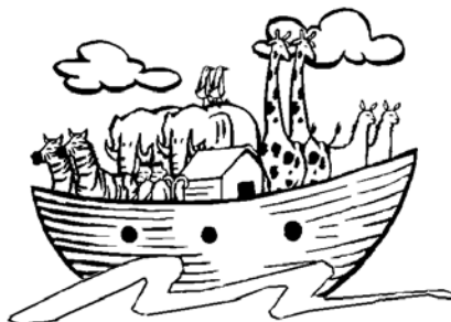
The story of Noah and his ark is in Genesis 5:29 - 10:32